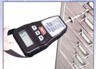
Hand-held drawer testing

** Not available on the CFG + 200 N or 500 N